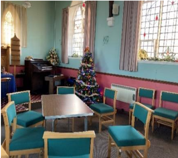
Clough chapel at Christmas

We enjoyed having the Clough and Risegate Primary school with us for their Christmas sing- along on 13 th December. The chapel was full to capacity with around 200 with children, parents and family members enjoying the festive season. It is always wonderful to have the chapel full and especially with young people at such a happy time. We look forward to welcoming them back at Easter.