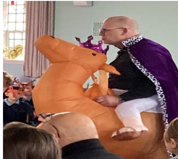
Our very own visiting king

Our Plough service was held on 7 th January. This annual service celebrates the start of the agricultural year, being held on the Sunday following Epiphany. Traditionally work on the fields then began the day after Plough Sunday. It has to be said that farming has changed over time and this was highlighted during the service by an interview with a local farmer who gave an interesting and informative account of life on the farm today. Another sign of the times was the very wet weather and flooding which has impacted farming and which we also heard about. It also prevented our vintage tractor and plough from being present at the service but we were still able to celebrate farming and the work of farmers with the Blessing of the Plough.